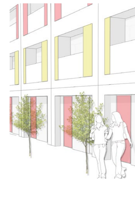
Six storey apartments with balconies overlooking the pedestrianised walkway.