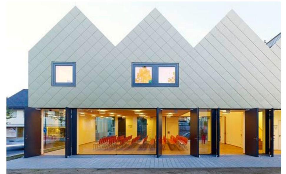
St. Gallus Community Centre, Rodermark Germany

Community centre with space for active interaction between residents and collaboration with the wider community with a cafe space.