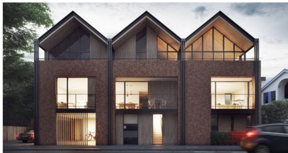
Thamsbige House, Henley Oxfordshire