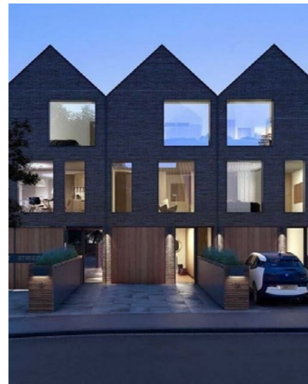
Abingdon housing, Oxfordshire