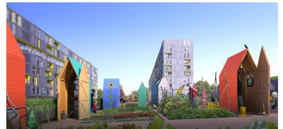
Saxton Housing, Leeds

Community centre with space for active interaction between residents and collaboration with the wider community with a cafe space.