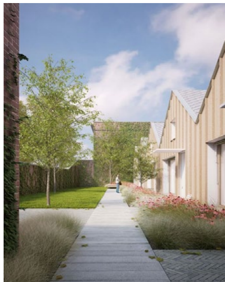
Wijnegem Elderly Housing, Belgium