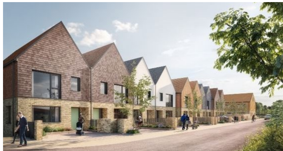
Craylands Estate, Basildon Essex