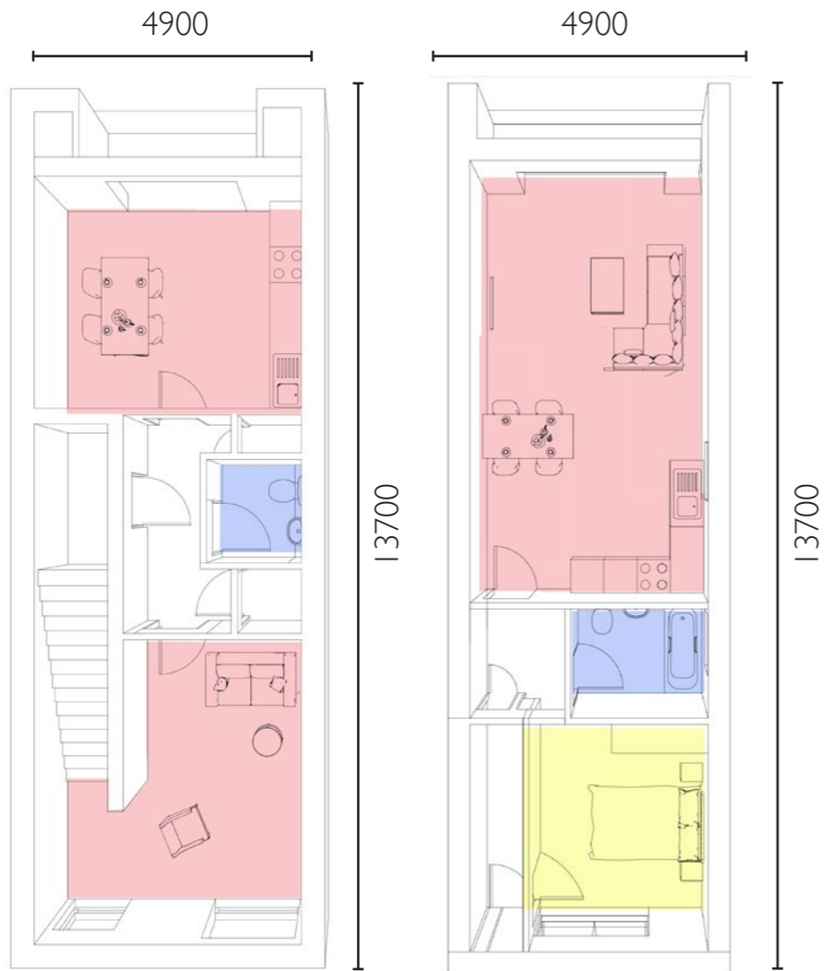
Possible Duplex Apartment (2 Bed) Ground Floor 99 sqm (Maximum dimensions)