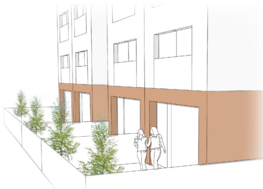
Three storey duplex flats. Each have access to either a ground floor garden or balcony.