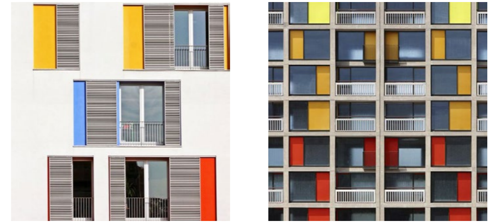
Olympic Village, Turin Italy Coloured window reveals and doors